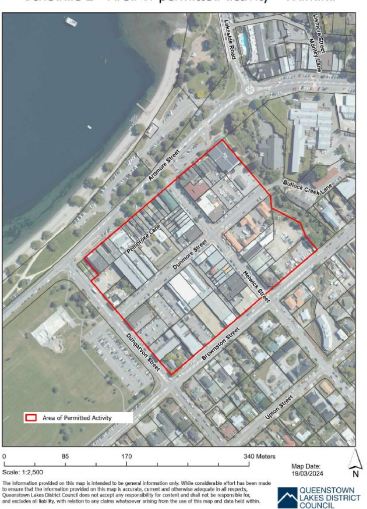
Schedule 2 - Area of permitted activity - Wānaka

Deleted: Schedule 2 – Map of permitted areas within Wānaka Town Centre Zone