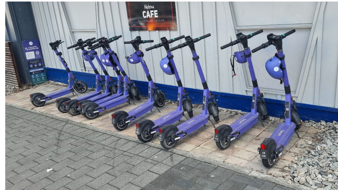
Beam e-scooters outside Night 'n Day Church St